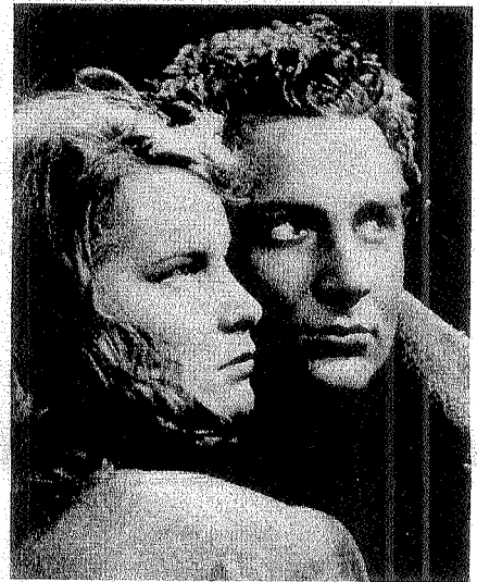
Alida Valli as Kira and Rossano Brazzi as Leo

First published in 1936, We the Living delivered a searing indictment of the collectivist ideal, at a time when many intellectuals in the West had been seduced by the ostensibly moral appeal of socialism. "Too controversial" to be commercially promising, the manuscript had been circulated for two years before a publisher was found for it. When the book finally appeared (in the same year as Gone with the Wind ), it was ignored in the