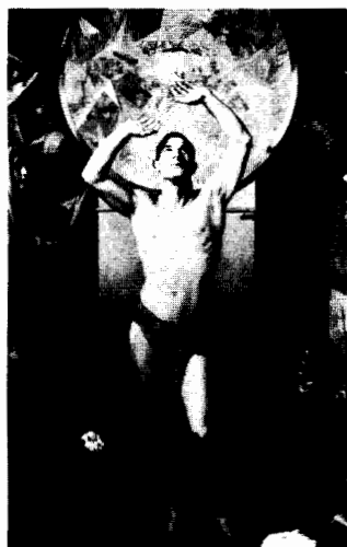
R.H. Ives Gammell, Predicament